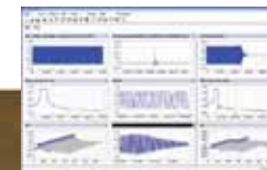
X-COM® WaveCAFE Signal Analysis