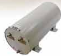
Tower Top Amplifiers