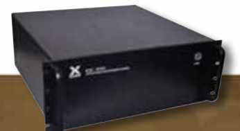
X-COM® IQC2110 Signal Capture/Playback