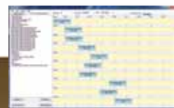
X-COM® RF Editor Signal Creation