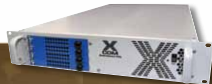
X-COM® 4CH-VSG-2000 Signal Generator

X-COM® Systems Provides a Powerful Capability to Capture, Store, Analyze and Create Complex Rf Signals.